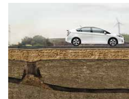
Bridging of Sinkholes