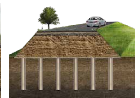
Embankments on Piles