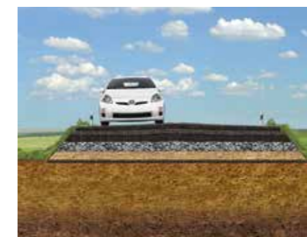
Permanent road and traffic areas