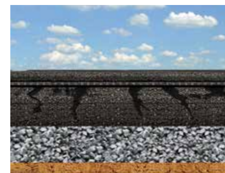
Rehabilitation of asphalt surfaces