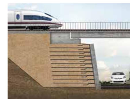
Steep slopes and support structures