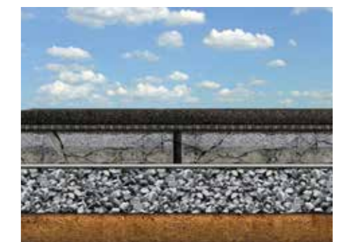
Rehabilitation of concrete surfaces with asphalt